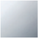
polished chrome 13 801 809-00