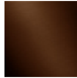
Dark Bronze matte 13 801 809-17

More custom finish options are available via special production (xTra Service). Please see our finish matrix for availability and pricing or contact a Dornbracht representative.