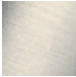
platinum matte 13 801 809-06