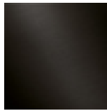
Dark Platinum matte